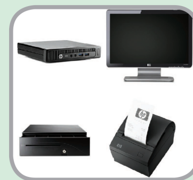
ADVANCED Hardware Bundle $4650.00

The best just got better with this fully integrated, high-speed point-of-sale (POS) system which includes the latest software and a new HP RP9 All-In-One PC with a touch-screen. This updated bundle features a sleeker design, with a larger widescreen monitor and Windows 10 preinstalled. To provide excellent performance, it includes a solid state drive (no moving parts) with 128GB of storage space, an Intel i5 processor, and 8GB of RAM. It also includes a 7-inch customer-facing LED pole display that can be used for marketing to your customers along with the current transaction details. The package also comes with a receipt printer and paper, cash drawer, and a handheld barcode scanner with stand.