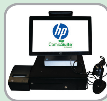
PREMIUM Hardware Bundle $5650.00

All Hewlett-Packard components! Includes FREE on-site HP warranty program!